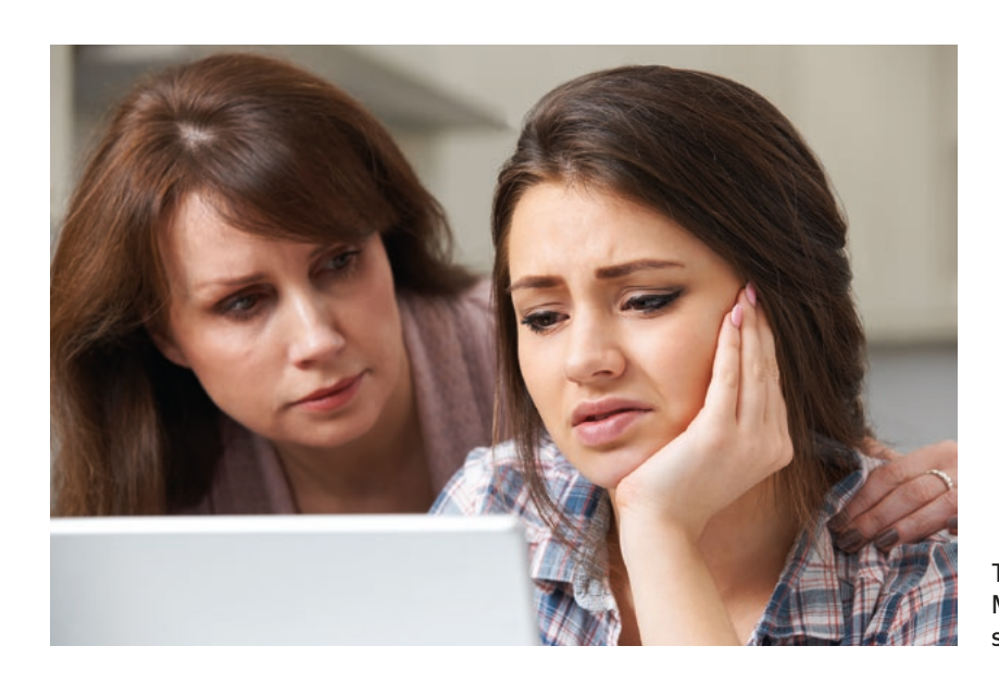
The Relational Safeguarding Model sees parents as the solution, not the problem.